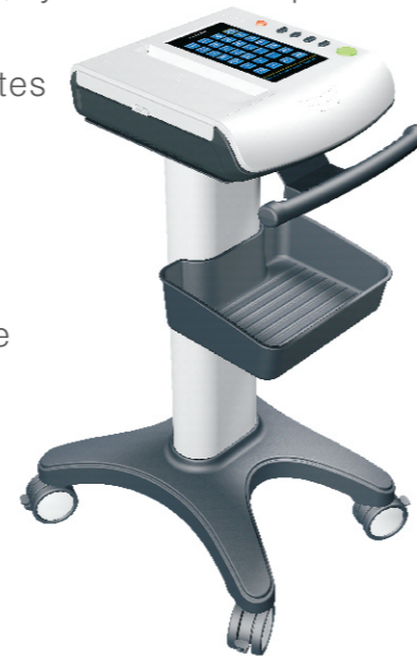
Strong and lightweight trolley