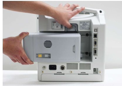
△ Detachable Module