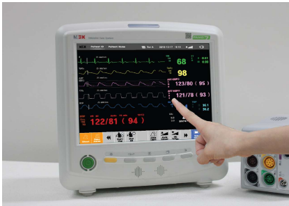
△ 12.1" TFT LCD Touch screen