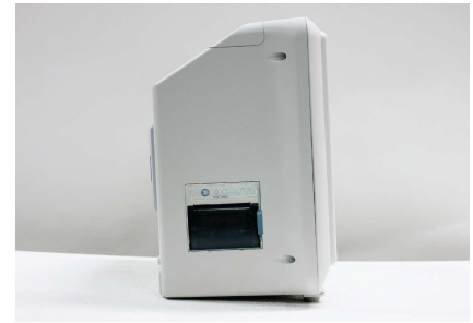
△ Thermal Printer (58mm)