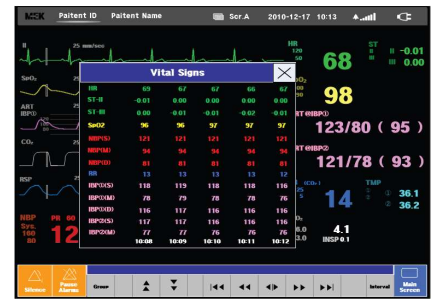
△ 168 hours Trends