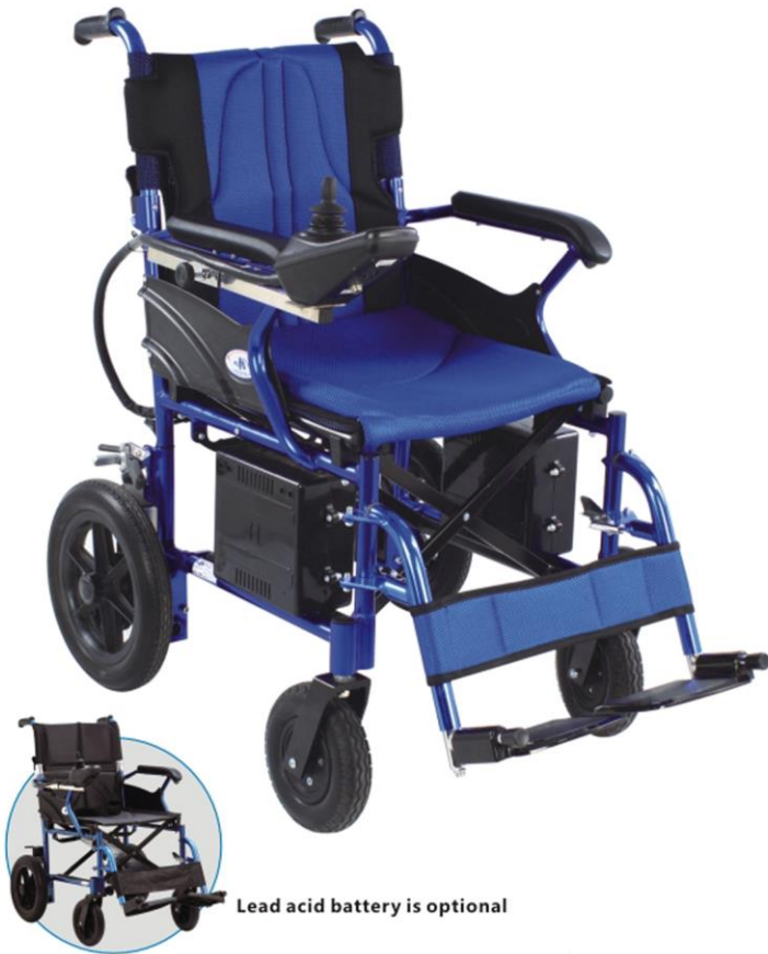
Lead acid battery is optional